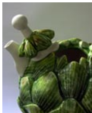
Top 4 pics: the artichoke teapot photographed from 4 different angles